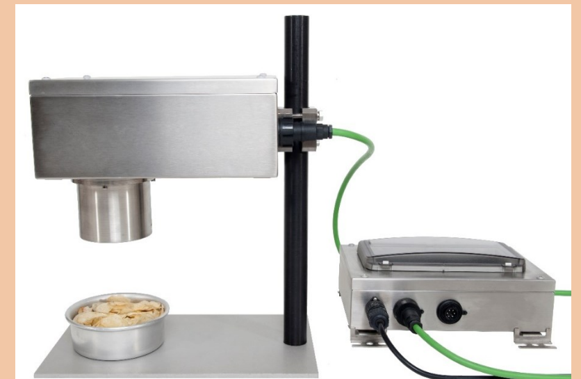
The Senware CR100 FF On-Line Colorimeter