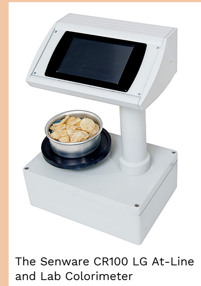
The Senware CR100 LG At-Line and Lab Colorimeter

44 Portland Street, 4th Floor Worcester, MA 01608 sales@senwarena.com Ph: +1 (561) 6325046