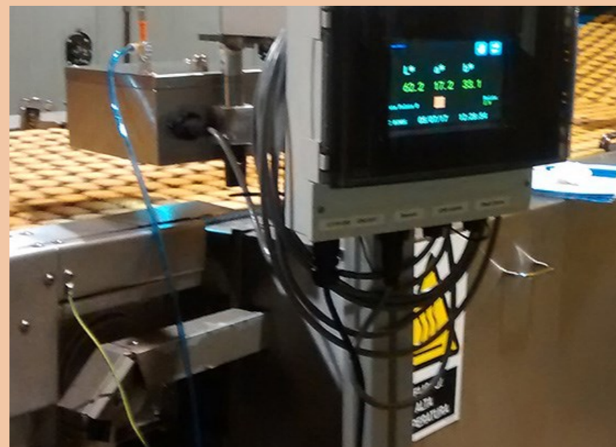
The Senware CR100 FF On-Line Colorimeter Display Monitors a Biscuit Production Line